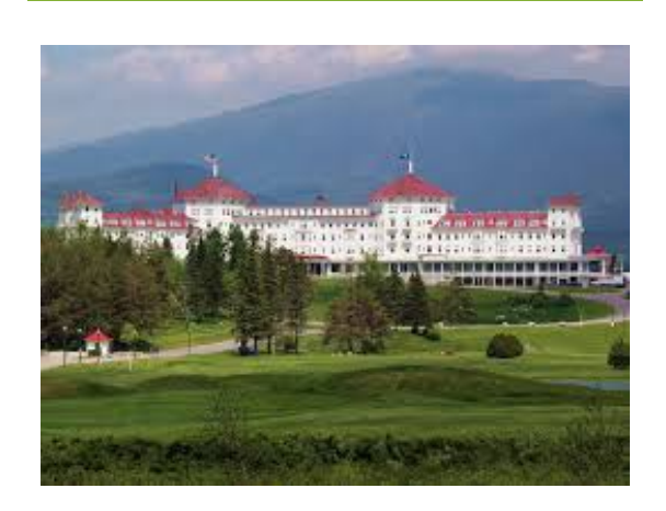
Time to register for the NH-LIFT Summer Summit

NH-LIFT is already having an impact on research collaborations across NH.